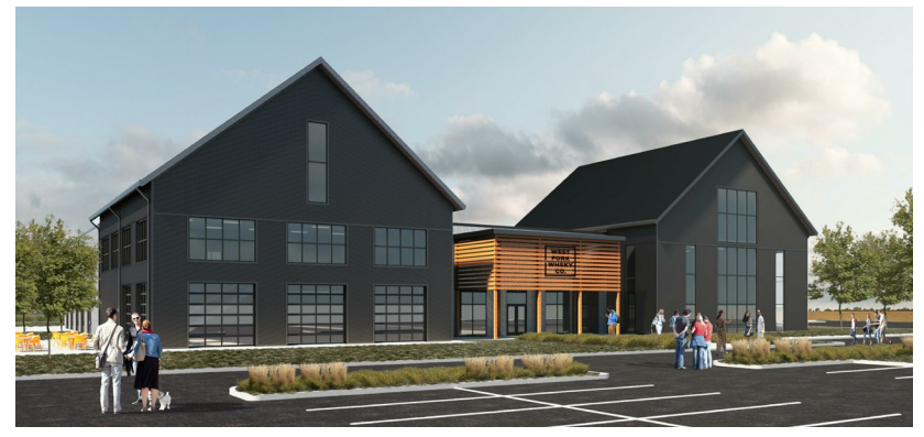
Rendering of the approved West Fork Whiskey Distillery. Future site located northwest and adjacent to Grand Park.